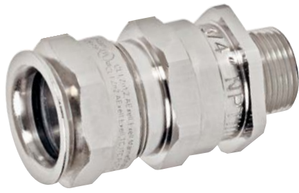
ADE 4F ISO